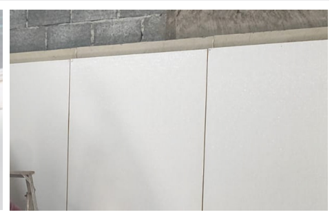
Glasbord® with Surfaseal® Sandwich Panels (Hygispan®)