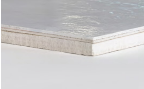
Glasbord® with Surfaseal® laminated on Rigid Board (Hygimat)